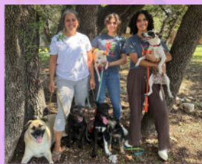
FEATURING HAMILTON - 4TH "FOSTER FAIL" FOR A TOTAL OF 6 LOVELY CANINES

RACE FOR THE RESCUES 8 A.M. ALAMO HEIGHTS SWIMMING POOL